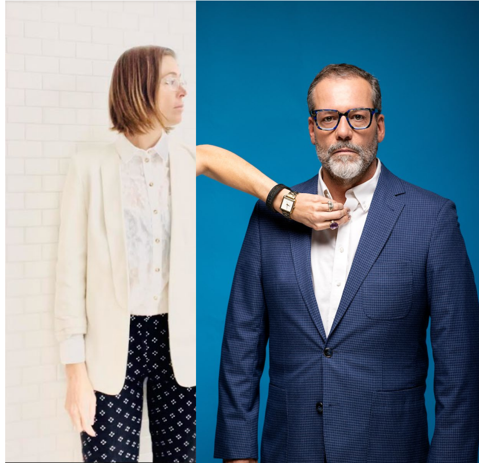
The Emily & Casey Show